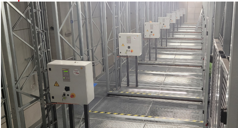
AMFE protected areas at Liebherr-Logistics GmbH

In the event of a fire, the AMFE triggers at an earlier stage, either thermally or via smoke detectors, and automatically reports the fire to the higher-level fire alarm system. This prevents fires from spreading in the first place and protects employees from the dangers of fire at all times. Thanks to AMFE and multialert®, production and shipping stoppages as well as plant downtimes are prevented. Loss of goods due to the consequences of fire can be virtually ruled out. In this way, we help to guarantee the uninterrupted supply of spare parts by Liebherr-Logistics GmbH worldwide. For questions about application possibilities or technical details of the AMFE mini fire extinguisher, please contact Markus Fiebig ( markus.fiebig@job-group.com ).