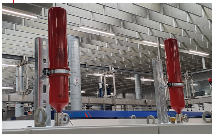
The AMFE mounted on top of an electrical cabinet