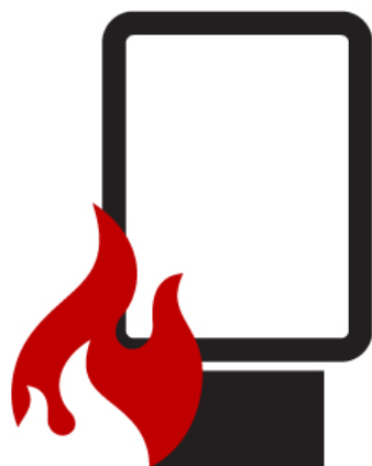
Fire from the outside